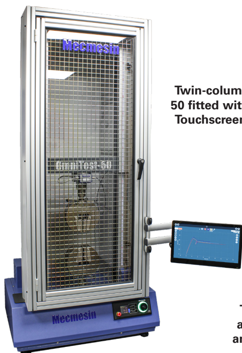
Twin-column OmniTest 50 fitted with guard and Touchscreen Controller

This Touchscreen Controller is an all-in-one PC solution with a bright, full HD capacitive touchscreen. Located on the machine itself, it delivers the benefits of a more efficient, self-contained software-controlled materials testing system, and occupies less bench-top space than a PC/monitor.