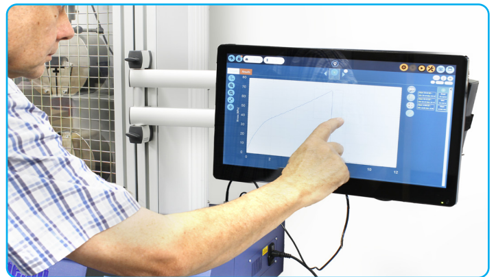
Full VectorPro functionality available from the controller

The fully adjustable mounting arm and brackets ensures a comfortable and ergonomic working environment