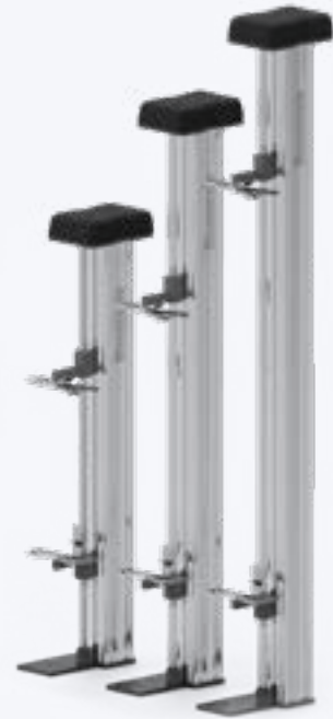
MLTE 700, MLTE 1000 and MLTE 1200

VectorPro MT is Mecmesin's dedicated materials testing software, used for the programming, control and acquisition of data from OmniTest and MultiTest-dV systems. It captures at high-speed the signals from load cells and extensometers, graphically displays stress/strain data and performs common materials testing calculations with the flexible transfer of raw data and results to Excel™ or a PDF™ report.