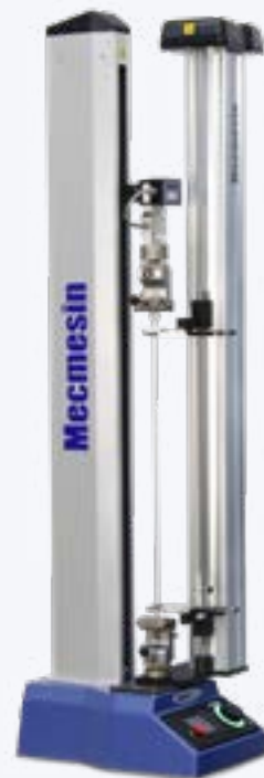
MLTE 1200 mounted on MultiTest-dV 0.5 kN