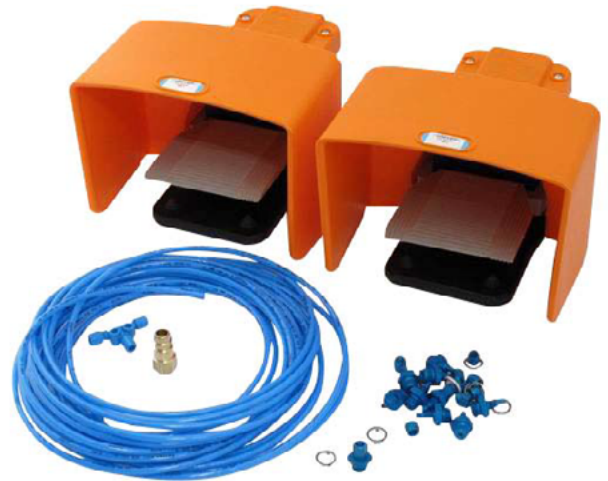
Mec205-1 non-locking Foot Switch shown with tubes and fitting

Scope of delivery: All 3 switch types are supplied with tubes and fittings for connection to your compressed air supply.