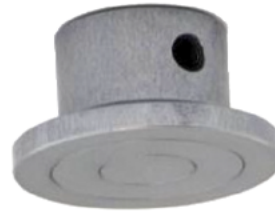
Mec23-56-B-St Fixed Compression Plate 56mm diameter with QC-32mm bore- hole