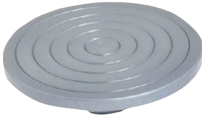
Mec23-116-B-St Fixed Compression Plate 116mm diameter with QC-20mm bore- hole