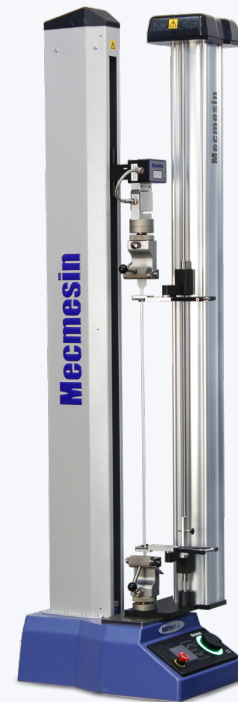
▲ MLTE 1200 mounted on MultiTest-dV 0.5 kN