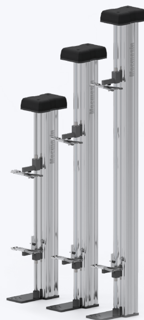
▲ MLTE 700, MLTE 1000 and MLTE 1200

VectorPro MT is Mecmesin's dedicated materials testing software, used for the programming, control and acquisition of data from OmniTest and MultiTest-dV systems. It captures at high-speed the signals from load cells and extensometers, graphically displays stress/strain data and performs common materials testing calculations with the flexible transfer of raw data and results to Excel™ or a PDF™ report.