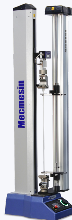
▲ MLTE 1200 mounted on MultiTest-dV 0.5 kN