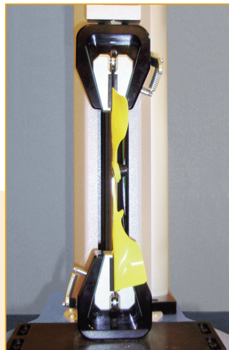
Transverse pull test

A Mecmesin MultiTest 2.5-xt console-controlled test stand was supplied with wedge grips for the transverse pull test, effectively tearing the two leaves apart from their ends. Custom slotted grips were adapted from the previous test design, for pulling along the axis of the connecting pin. Under control of Mecmesin Emperor™ software, tests can now be run in stages, for example being held in tension at specific loads before being pulled further to breaking point, and run at a required speed of 500 mm/min. Programming these tests is easy and the measuring and reporting functions provide comprehensive test profiles.